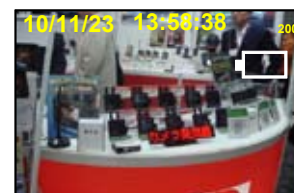
Portable DVR Operation